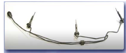
CFG6 EGT Harness