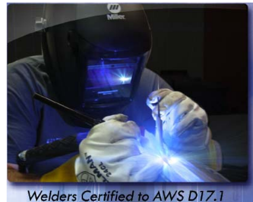
Welders Certified to AWS D17.1

LKD Aerospace, Inc. 8020 Bracken Place SE Snoqualmie, WA 98065