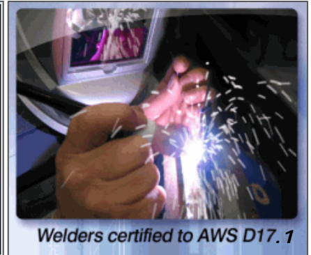
Welders certified to AWS D17.1

Limited Accessories and Limited Instruments - FAA FAR145 Repair Station#1LKR990Y and EASA 145.6103